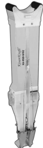
KK-MSD-SF02 (Double Barrel)