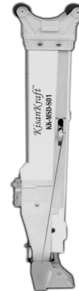
KK-MSD- S01 (Single Barrel)