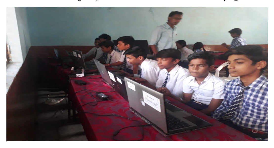
Photo of Shiva Convent Inter College, Jhansi, UP, that has started its computer education with KisanKraft donated laptops

b. Company also funded "Training of Trainers" program, an 8 days fully residential computer training held in January 2019 at Gurgaon, by Computer Shikhsa, for 65 trainers. These trainers then teach computer skills to students at schools. Following is a picture of training session: