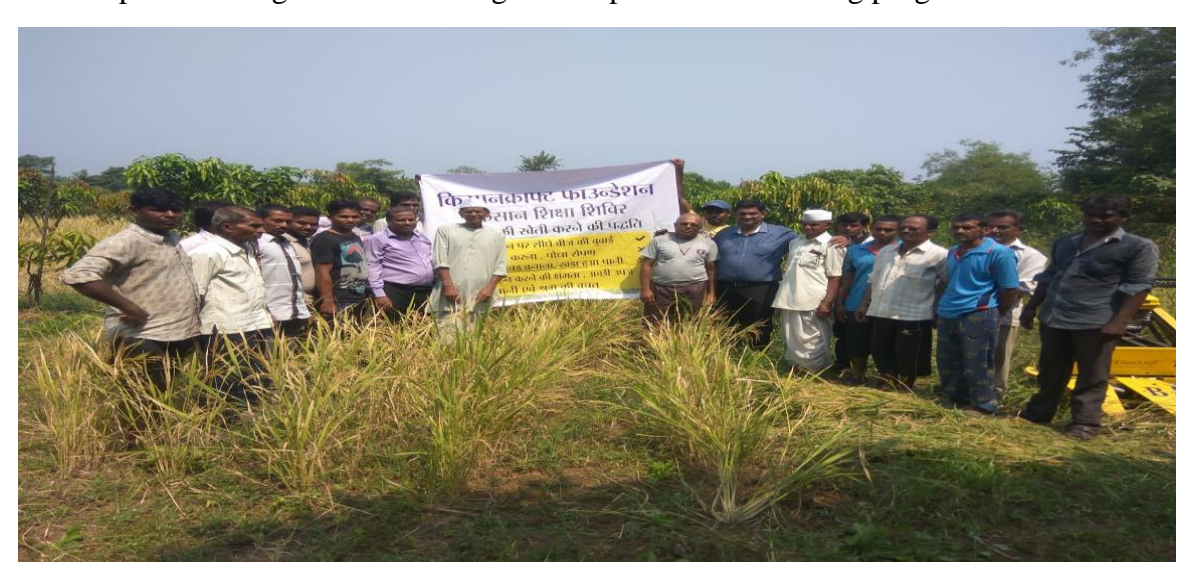
Training program at Navasari, Gujarath held on 9th October, 2018

6. Company has provided funds for conducting training programmes for farmers and rural labours. 6 training programmes were conducted, on package of practice on cultivation of rice and Training on Harvesting Machine Operator, during FY 2018-19 by KisanKraft Foundation for 188 trainees at Navasari, Gujarath; Farukhabad, Lucknow; Dhamtari, Chattisghar; Itarsi, Bhopal and Bangalore. Following are the pictures of Training programmes: